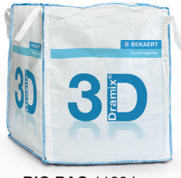
BAGS 20 kg